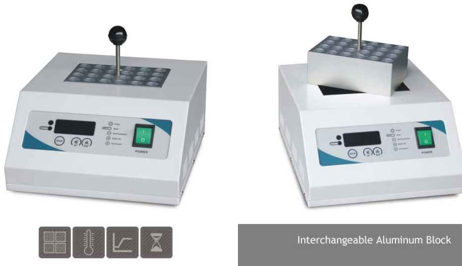
JSBL-01T Dry Block Heater